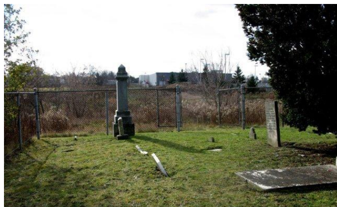
Ryckman Family Cemetery, Hamilton, ON