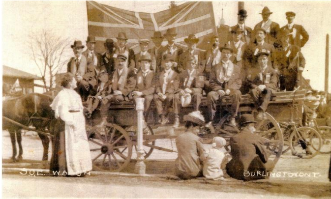
“S.O.E. Wagon” ready for a parade

While sorting through a donation we came to this photo – who or what are the S.O.E? Someone suggested “Sons of England” - note the Union Jack (flag). It appears the float is about to take part in a parade. Is it on Brant Street?